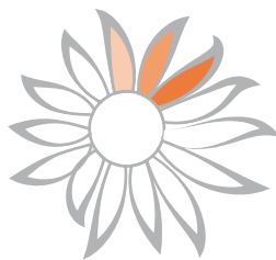
Commercial extract # 1

While traditional extraction techniques focus on the extraction of only one group of compounds, renouncing the substantial health benefits reserved to the other phytochemicals, Natac's Full Plant Profile extracts gather all the benefits of the plant in a single extract.